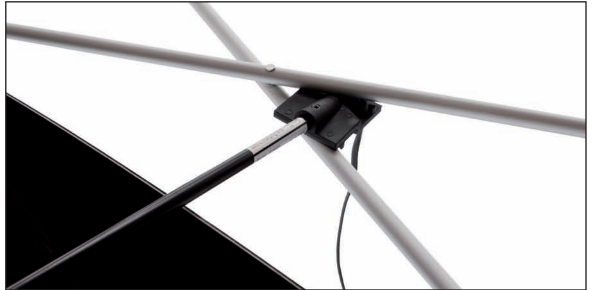
View from top.